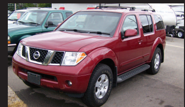
2007 NISSAN PATHFINDER SE 4WD Alarm, seats 7, fold down back seats, tow pkg. AS LOW AS $249 A MONTH

Recent bankruptcy? No problem! • Collecting Unemployment? No problem! • Fixed income/SSI? No problem! • Self Employed? No problem!