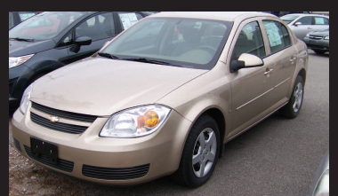
2007 CHEVY COBALT LT 29 MPG, air, cruise AS LOW AS $199 A MONTH