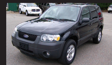
2005 FORD ESCAPE XLT AWD, Keyless entry, great MPG in a SUV. AS LOW AS $199 A MONTH