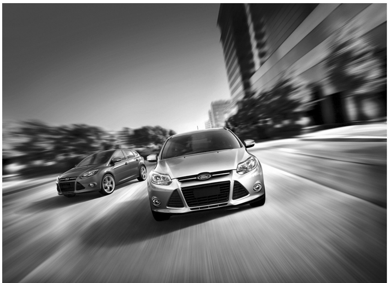
The 2013 Ford Focus earned a Top Safety Pick+ rating from the Insurance Institute for Highway Safety. Focus is one of six vehicles in the small car segment to achieve IIHS's highest rating.