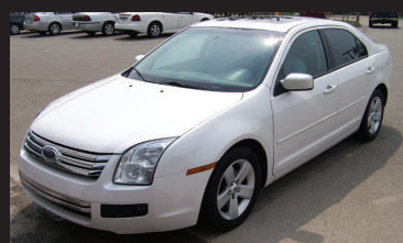
2009 FORD FUSION SE Sunroof, SYNC, loaded. A nice car with 28 MPG! AS LOW AS $199 A MONTH