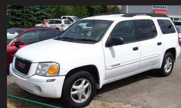
2004 GMC ENVOY XL 4WD, 3rd row seat, nice. AS LOW AS $199 A MONTH