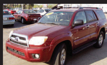
2006 TOYOTA 4 RUNNER Air, cruise, tow pkg. AS LOW AS $199 A MONTH