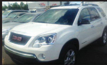
2007 GMC ACADIA SLE AWD, DVD, rear entertainment, 3rd row seat AS LOW AS $199 A MONTH