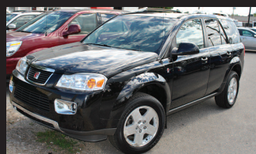
2008 SATURN VUE V-6, aluminum rims, clean. AS LOW AS $199 A MONTH