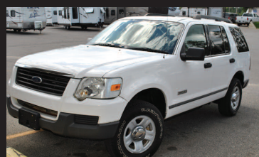
2006 FORD EXPLORER 4x4, tow pkg, new tires. AS LOW AS $199 A MONTH