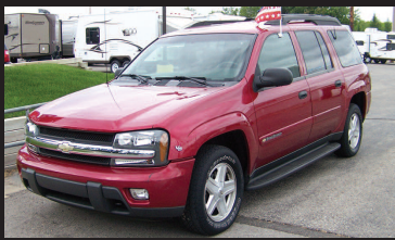
2003 CHEVY TRAILBLAZER EXT 4WD, seats 8, loaded, tow pkg AS LOW AS $199 A MONTH