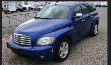
2006 CHEVY HHR LT 30 MPG, seats 5 plus lots of cargo room. AS LOW AS $199 A MONTH