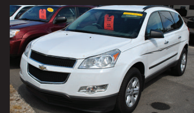
2009 CHEVY TRAVERSE LS AWD, 3rd row seat. AS LOW AS $199 A MONTH