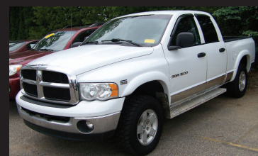
2004 DODGE RAM 1500 SLT QUAD CAB 4x4, seats 5, bedliner, tow pkg AS LOW AS $199 A MONTH