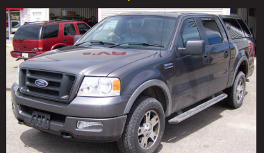
2005 FORD F-150 FX4 4WD, 115K, leather, loaded. Nice truck! ONLY $14,995