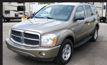
2004 DODGE DURANGO SLT 4WD, 5.7L Hemi, leather, air, cruise, seats 7. AS LOW AS $199 A MONTH