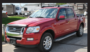
2007 EXPLORER SPORT TRAC LIMITED 4x4, leather, power sunroof, new tires. AS LOW AS $249 A MONTH