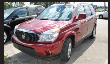
2007 BUICK RENDEZVOUS CXL Leather, sunroof, 3rd row seat. AS LOW AS $199 A MONTH.