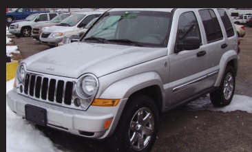
2006 JEEP LIBERTY LTD. 4x4, Sporty SUV AS LOW AS $199 A MONTH