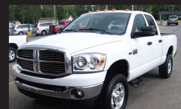
2009 DODGE RAM 2500 5.7L Hemi, 4x4, quad cab, tow pkg, 1 ton AS LOW AS $269 A MONTH