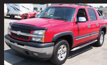
2005 CHEVY AVALANCHE Z-71 4x4, 4 door, cargo area cover, air, cruise, loaded. AS LOW AS $249 A MONTH